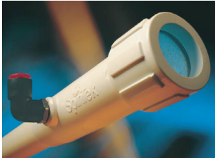
SpinTek Filtration Tubular Ultrafiltration Membranes provide superior performance as direct tube replacements in existing in-plant systems.