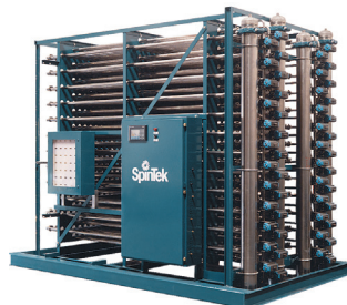
SpinTek's Membrane Products Group specializes in solutions for waste and process streams formerly considered untreatable.